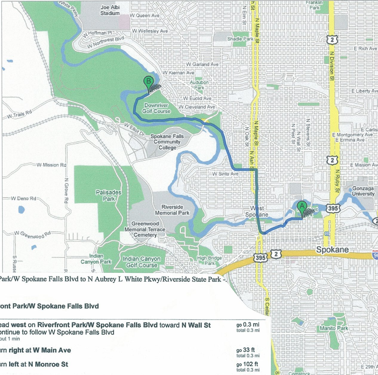
Riverfront Park/W Spokane Falls Blvd to N Aubrey L White Pkwy/Riverside State Park -